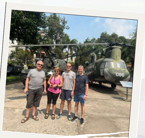
War Remnants Museum